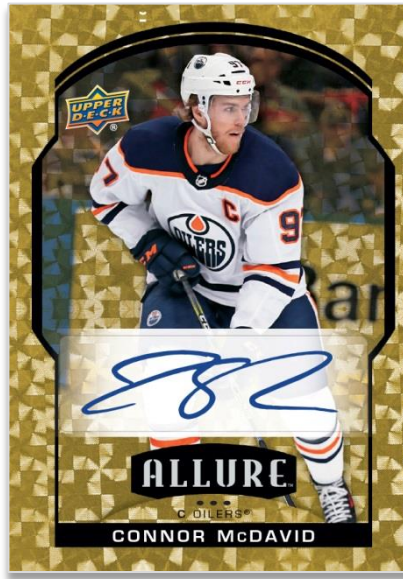
BASE SET Golden Treasures Auto Parallel