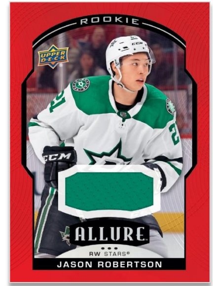
BASE SET Red Rainbow Rookie Jersey Parallel

Allure™, now in its second season following a very successful 2019-20 debut, sports a 150-card Base Set featuring 70 Veterans, 30 Rookies and 50 SP Rookies – the latter falling 1 per pack , on average. The parallels range from simply color and pattern variations to color and pattern variations with autographs and/or memorabilia.