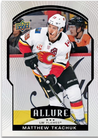
BASE SET Regular