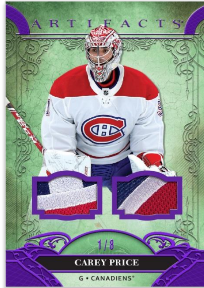
BASE SET: STARS Material Purple Parallel