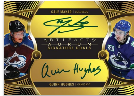
AURUM DUAL AUTO Bounty Achievement Card

For complete 2020-21 Artifacts Bounty Mission details, please visit UpperDeckBounty.com on or after release date.